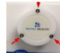
One Way Valve